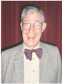
Mark Jamieson as Teddie Deakin